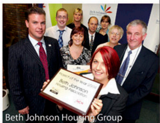
Beth Johnson Housing Group

"Very pleased with the instructor. Did not rush through the tasks and explained in different ways when I did not understand"